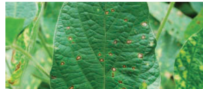
Frogeye Leaf Spot

Quadris Top SB not only provides outstanding physiological benefits, but it also reduces the effects of unwanted disease pressures in a field. Quadris Top SB is a robust combination of two industry-leading chemistries to create one of the most powerful fungicides on the market. With multiple modes of action, the preventive and curative activity of Quadris Top SB provides broad-spectrum disease control, including protection against strobilurin-resistant frogeye leaf spot.