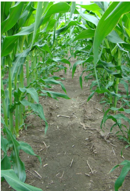
Lumax (1.5 qts./A) 48 days after application