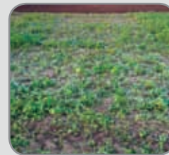
Laudis 3.0 oz/A

Applied April 24th, 2009. Photos taken 40 days after treatment. Marshall, Missouri. Weed species present were waterhemp, ivyleaf morningglory, fall panicum, giant foxtail, velvetleaf and lambsquarters.