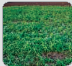
Impact 0.75 oz/A