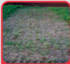
Callisto Xtra 20 oz/A