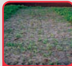
Callisto Xtra 20 oz/A