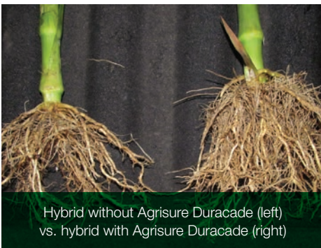
Hybrid without Agrisure Duracade (left) vs. hybrid with Agrisure Duracade (right)