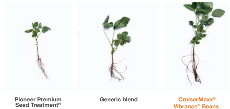
Syngenta trials, 2017, Kinston, North Carolina

2016 Syngenta Seedcare inoculated Trials (n=3). Combined protection across uninoculated, Pythium spp. & Rhizoctonia solani . Bay, Arkansas.