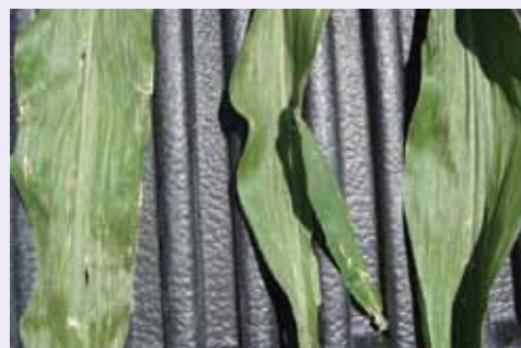
Headline® Untreated Quadris (3.0 oz/A) (6.0 oz/A)

In the photo above, the Quadris-treated corn ears are larger in size compared to the untreated ears.