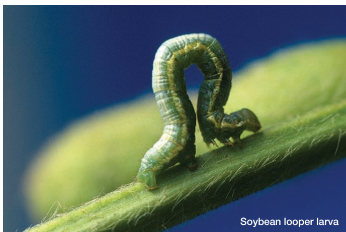
Soybean looper larva

Refer to label for a complete list of pests controlled