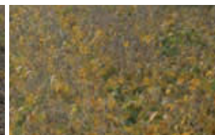
Quadris Top SB-treated, 57 bu/A

In this Mississippi trial, the Quadris Top SB-treated plants remained greener longer, extending photosynthesis. This allowed the fields to better utilize the sun's energy, resulting in a 5 bu/A advantage over the straight strobilurin-treated plants.