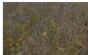
Straight Strobilurin-treated, 52 bu/A