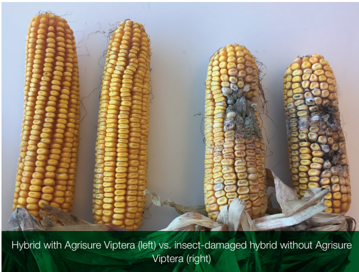
Atkinson, NE, 2017