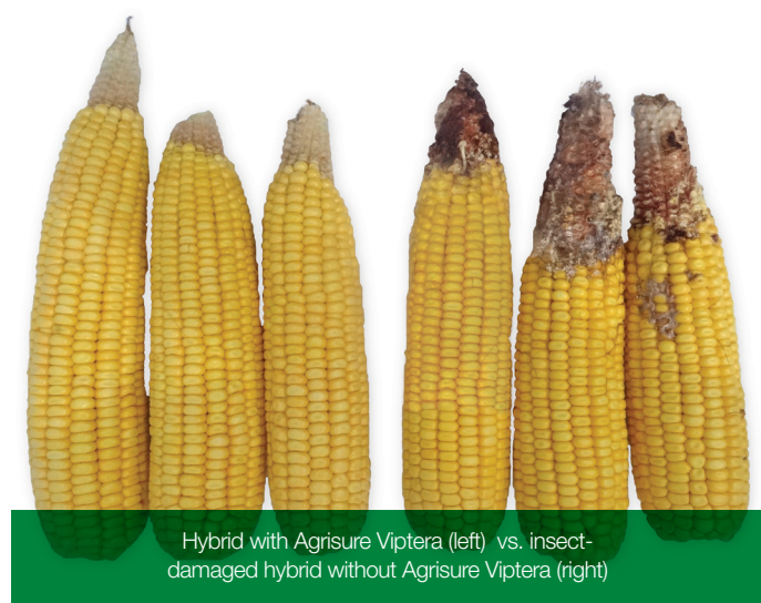
Columbia, MO, 2015