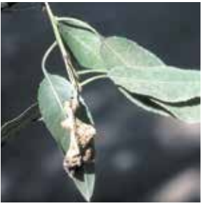
Reproduced from Compendium of Nut Crop Diseases in Temperate Zones, 2002, American Phytopathological Society, St. Paul, Minn.

In spring and throughout summer, infected leaves wither (at the base of shoots), turn brown and die.