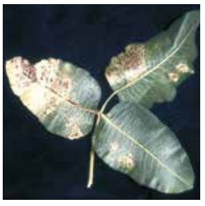
Courtesy: T. J. Michailides. Reproduced from Compendium of Nut Crop Diseases in Temperate Zones, 2002, American Phytopathological Society, St. Paul, Minn.

Small leaf lesions form with characteristic chlorotic margins. On immature (green) nuts, lesions are black and small (about 1 mm in diameter). Lesions on mature nuts are black, vary in size and are surrounded by reddish margins.