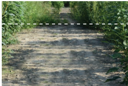
Prefix® followed by Tavium® + glyphosate Four effective SOAs

Images taken 55 days after post-emergence application