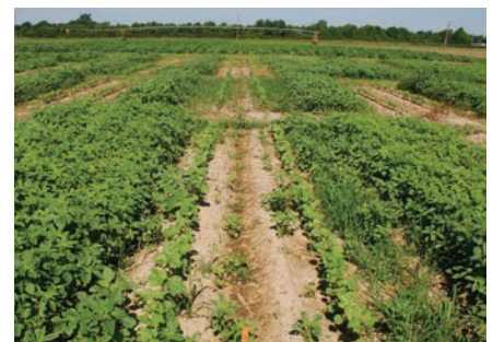
XtendiMax With VaporGrip Technology

2017 Syngenta trial HDC102A4, cotton; Mississippi.