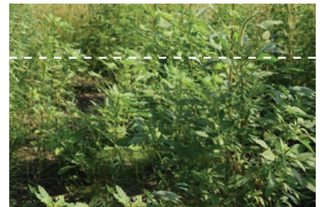
Warrant® followed by XtendiMax® With VaporGrip® Technology + glyphosate + Warrant® Three effective SOAs

2019 Syngenta bare ground herbicide demo, soybeans; Kinston, North Carolina.