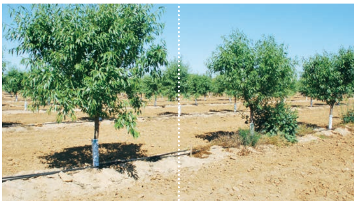
Broadworks and Alion® herbicide Untreated