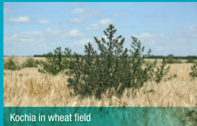
Kochia in wheat field