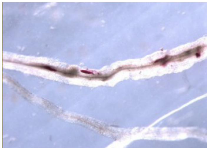
An SCN juvenile growing to maturity within a root.

SCN overwinter in the form of eggs, both individual eggs as well as those contained in cysts (cysts are actually a previous generation's deceased female