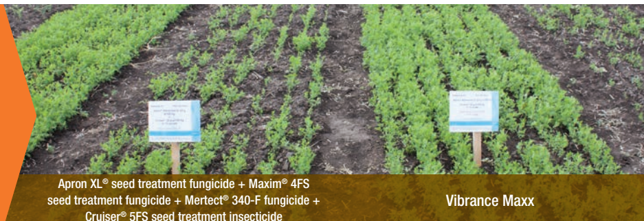
Apron XL® seed treatment fungicide + Maxim® 4FS seed treatment fungicide + Mertect® 340-F fungicide + Cruiser® 5FS seed treatment insecticide